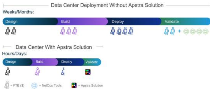
Figure 2: Automation improves efficiency.

Data center deployments are increasingly complex, especially for manual node-by-node configurations and provisioning, potentially leading to errors, inconsistencies, and delays. The Apstra solution dramatically simplifies network implementation by supporting both single- and multi-vendor switch environments as well as a range of network operating systems. The system's open architecture allows organizations to design a network that meets their business requirements first, then select the hardware that best aligns with that design.